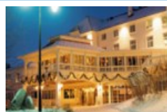
Dr Holms Resort & Spa